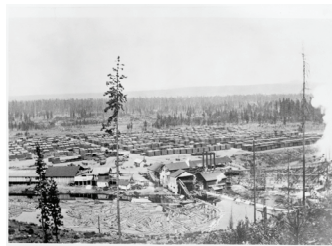
The Mill Pond and the Mt. Adams Pine Company mill operations as seen in the 1920’s

The land has healed with time, and the Mill Pond now looks more like a sanctuary for otters and waterfowl than logs destined for a sawyer’s headrig.