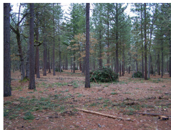
A pine-oak woodland thinning project overseen by MARS used low impact logging methods to protect habitat of sensitive species.

ing number of landowners interested in diverse values and the long term health of their forest. It is our goal to provide high quality services on a fee basis that will also help to connect local contractors with whom we are building relationships while diversifying our organization’s revenue streams. Please call us if you have a project you would like to explore!