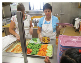
School-community garden bears fresh produce for school lunch program

Small Wood Utilization Initiative —Work continues at our log yard/incubator site near Glenwood as we continue to identify and grow markets for small diameter logs and woody biomass. Our new program manager will be dedicating more time to this project and expanding our efforts where other opportunities present themselves.